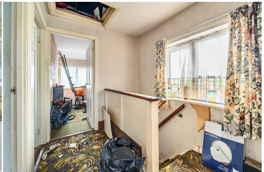
Ash Close, Par, PL24 2HD